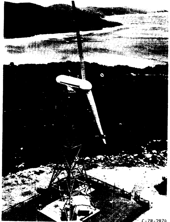
FIGURE 1. - MOD OA WIND TURBINE AT CULEBRA ISLAND, PUERTO RICO.

A photograph of one MOD-OA machine, located on Culebra Island, Puerto Rico, is shown as Fig. 1. Nearly identical machines were located in Clayton, New Mexico, Block Island, Rhode Island, and Oahu, Hawaii. The blades measured 125 ft, tip-to-tip. The hub center was 100 ft above ground level. The blades rotated at 40 rpm. The blades were mounted on the rotor hub, as shown in the cutaway drawing included as Fig. 2. The pitch actuator pitched the blades through a set of bevel gears located inside the hub. The hub was attached to a low-speed shaft which was connected to a speed increaser gearbox. A fluid coupling, attached to the 1800 rpm output shaft of the gearbox helped dampen out power oscillations. A high-speed shaft then transmitted power to V-belts which drove a synchronous alternator. The machine was housed in an 8-ft diameter nacelle.